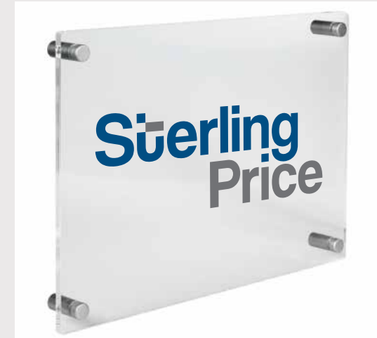
■ Exterior projection signage