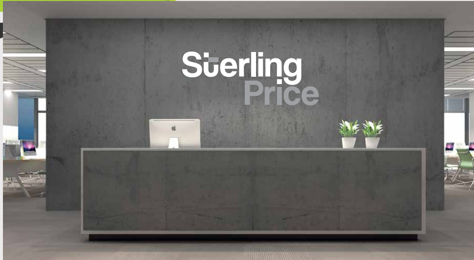
■ Bespoke office signage