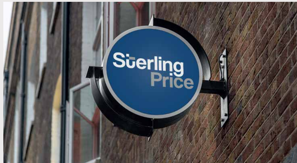
■ Exterior projection signage